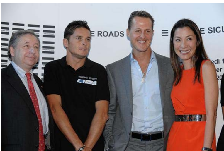
Jean Todt, Giancarlo Fisichella, Michael Schumacher and Michelle Yeoh