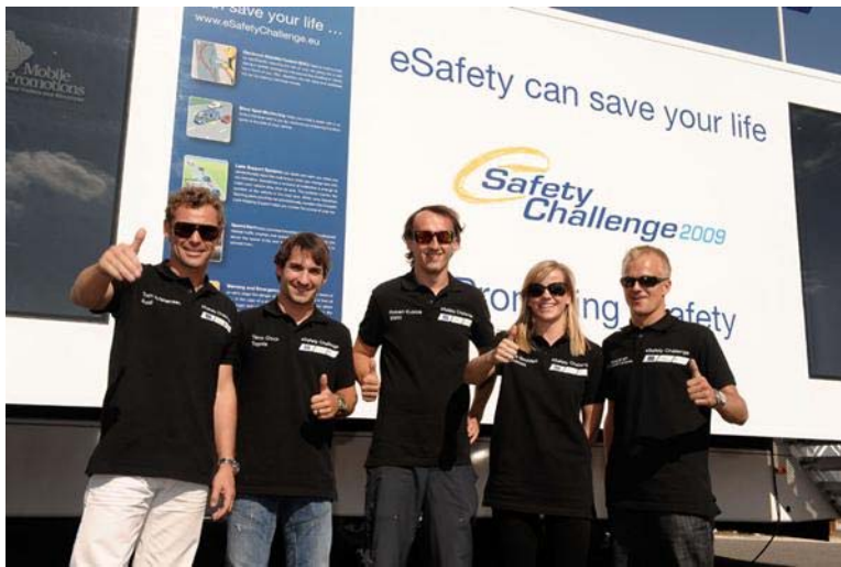
Tom Kristensen, Timo Glock, Robert Kubica, Susie Stoddart and Heikki Kovalainen